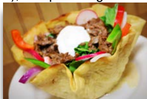
Steak taco salad...8.99