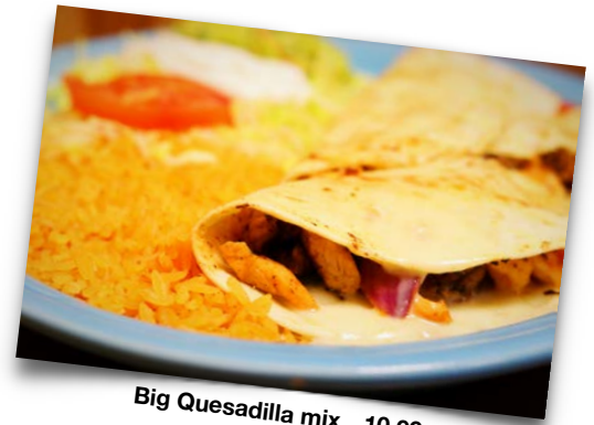
Big Quesadilla mix...10.99