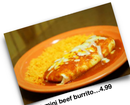
1 mini beef burrito...4.99