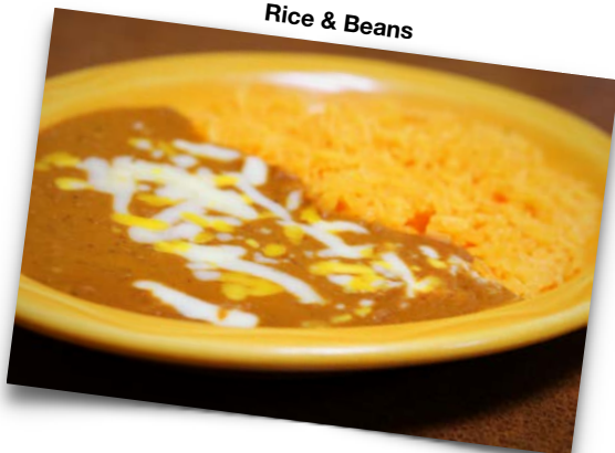
Rice & Beans