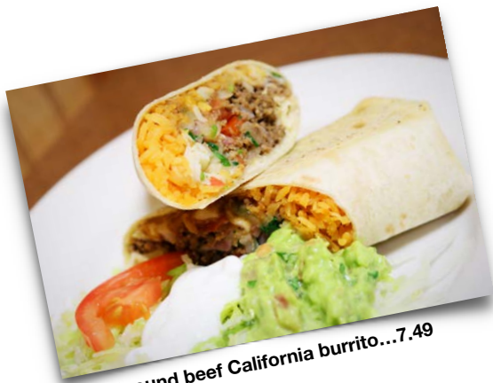
Ground beef California burrito...7.49