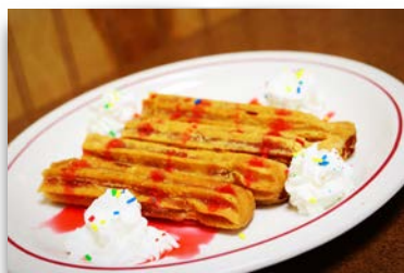
2 strawberry churros...3.99