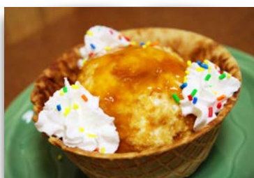
Fried ice cream...3.99