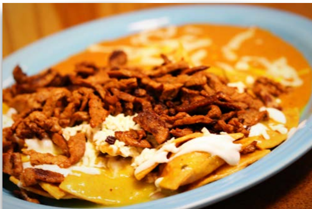
Chilaquiles with steak...9.99