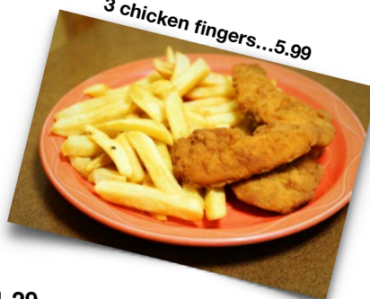
3 chicken fingers...5.99